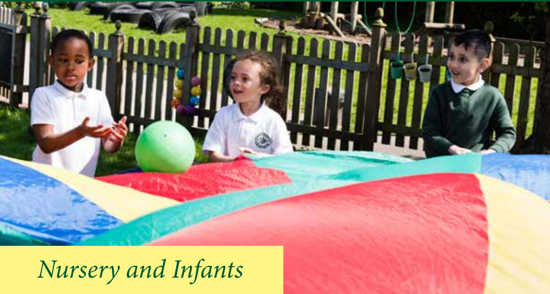
Nursery and Infants