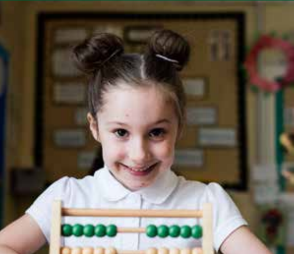
Nursery and Infants