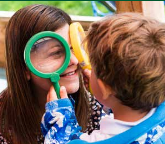
Nursery and Infants