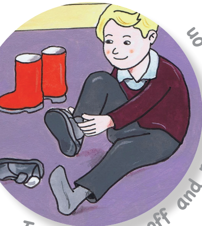
Taking shoes off and putting them on

Parents with children starting school soon, often ask us how they can help their child get ready for school. We have written this guide to help.