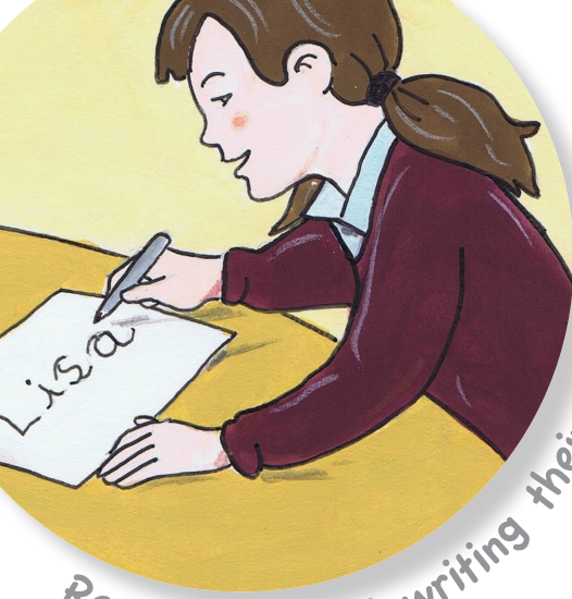
Recognising and writing their own name