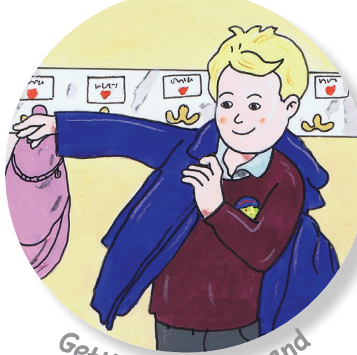
Getting dressed and undressed independently