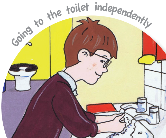
Going to the toilet independently