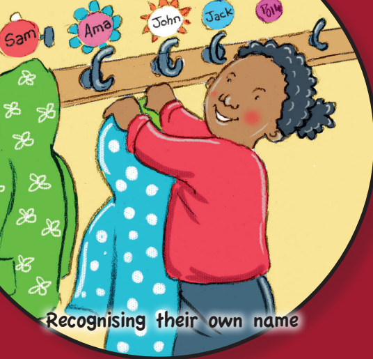
Recognising their own name

Writing their name with a capital and lower-case letters