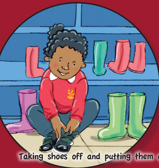
Taking shoes off and putting them on