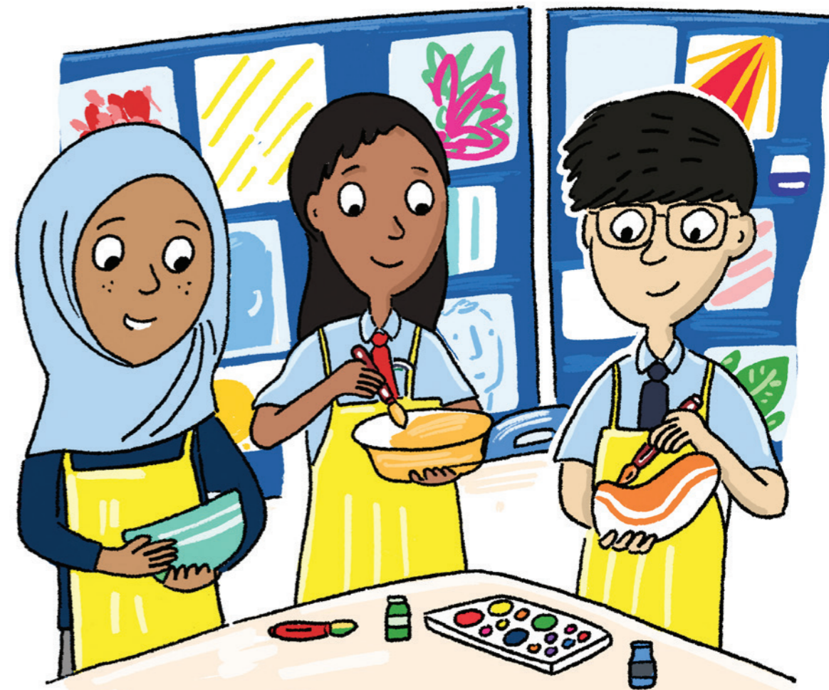
Students enjoying Art & Design Technology