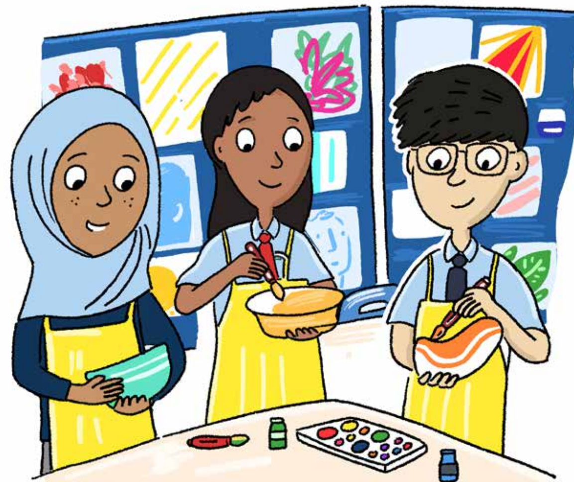
Students enjoying Art & Design Technology