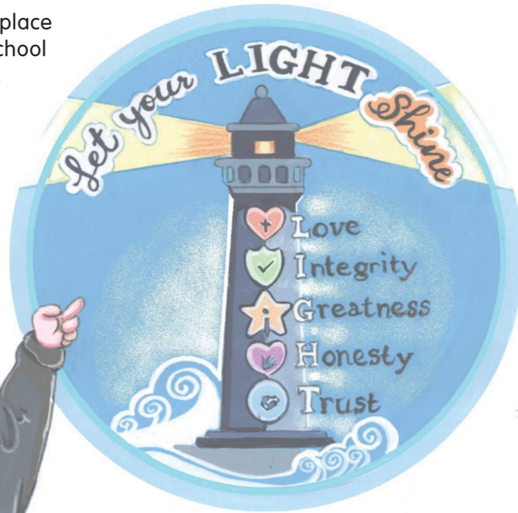
Macey is learning our LIGHT values.