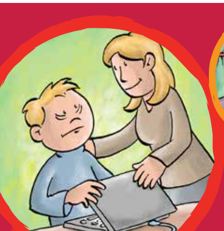
Dealing with upsetting content

Please read this leaflet through with your child and talk about the issues it raises. Please let us know if you have any questions or concerns and we will help.