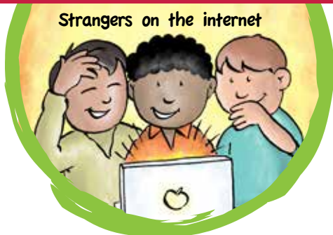
Strangers on the internet