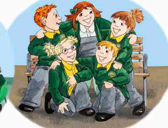
The children are getting to know each other as they do activities together.