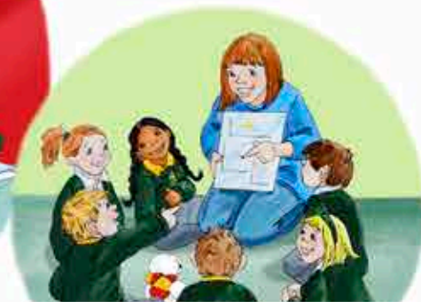
Your teacher will help you play games with your classmates, to help you get to know each other. You will also learn each other's name.