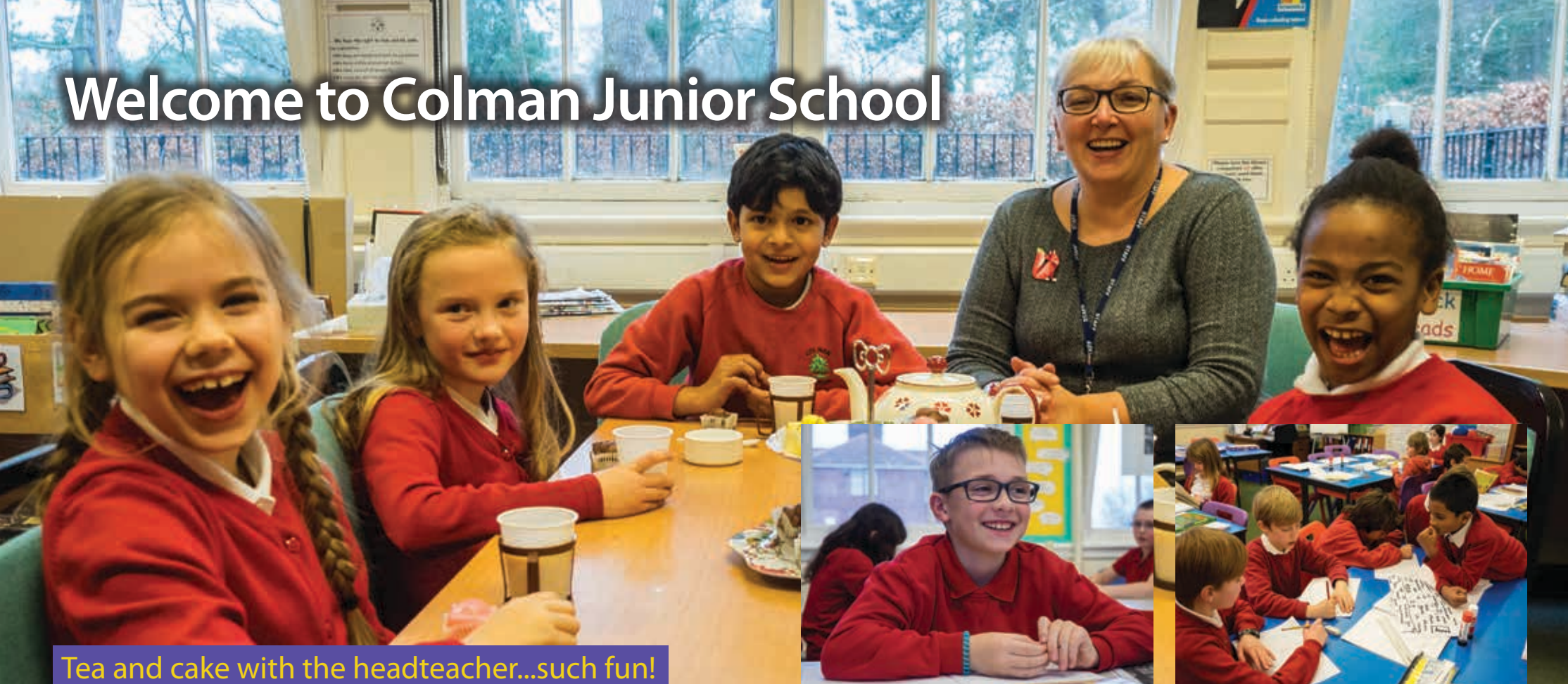
Tea and cake with the headteacher...such fun!