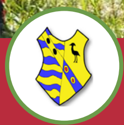
Cherry Tree Academy Marham Junior