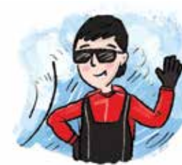
Dame Ellen MacArthur