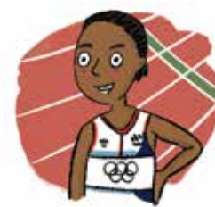
Dame Kelly Holmes

Each house has a Director of Character and Personal Development, a House Co-Ordinator and House Captain, who will be a senior student. The House Captain will promote participating in house activities and lead competitions.