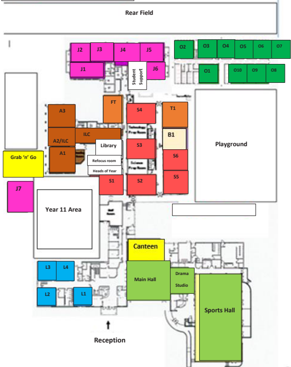
Map of the Ground floor