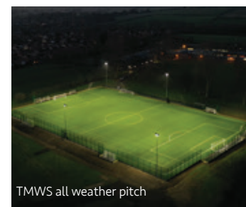
TMWS all weather pitch

Sport and performing arts make up a large part of our school clubs. There are regular competitive fixtures against other schools and productions and concerts taking place each school term with a big musical show once a year. We offer a wide range of other activities for those who are neither sporty nor enjoy performing. Chess club is very popular, taking place in the school Library which is also open every lunchtime and after school. Art and craft clubs run alongside aero modelling and creative writing.