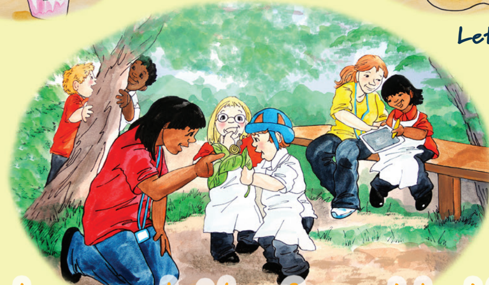
Playing and learning in our Forest School