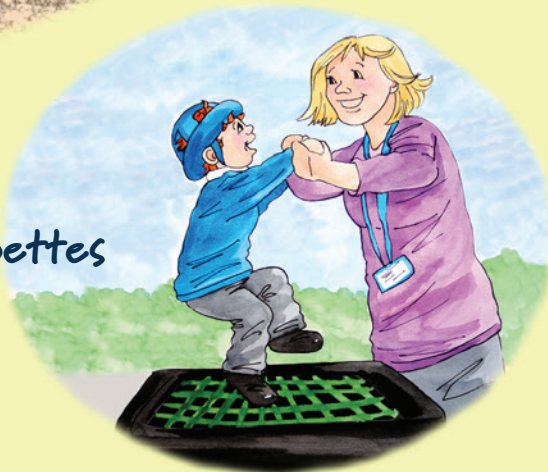
Playing on the trampettes