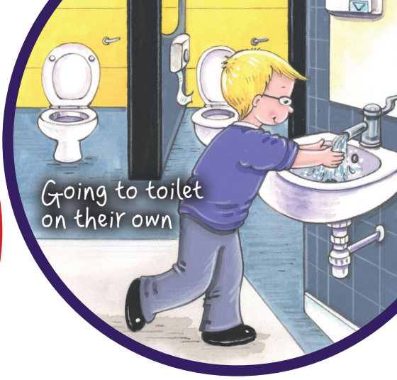
Going to toilet on their own