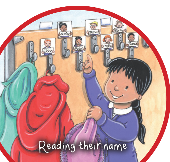
Reading their name